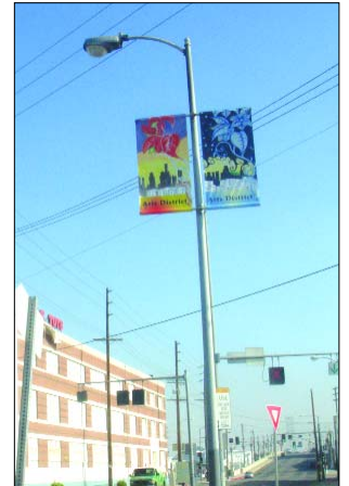
4th Place looking east