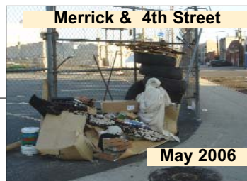
Merrick & 4th Street