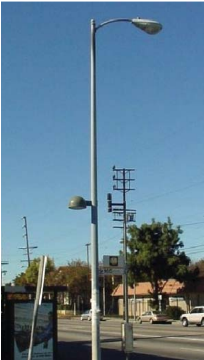
Many permanent new street lights have pedestrian fixtures which provide direct light over the sidewalk area creating additional safety and security measures.

The route, which will start as a 6-month pilot program, will operate Monday - Friday 6:30 AM to 6:30 PM. During those hours, buses will run clockwise (see map) at 20-minute intervals. As with all DASH services the monthly passes sell for $9.00 and DASH ticket books are $15.