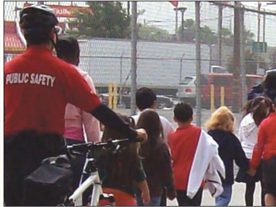
A CCEA safety officer escorts a Para Los Ninos pre-school class returning from a field trip a few blocks away.

Joined by Mayor Antonio Villaraigosa, actors Lisa Kudrow and Kate del Castillo, the event was capped by 30 fourth grade students from El Sereno Elementary School screening their short animated films.